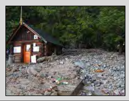
Stehekin Mudslide