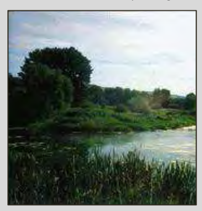
Wetlands, Confluence State Park, Historylink.org