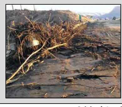
Malaga Mudslide