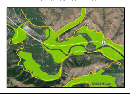
Potential Aquifer and Alluvial Soils, Wenatchee Basin Area

Source: Definitions are adapted from RCW 36.70A and WAC 365-190. See photo sources above. Aquifer map, BERK 2014