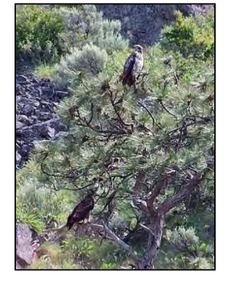
Bald eagles, Chelan County PUD

Artificial features such as irrigation delivery systems, irrigation infrastructure, irrigation canals, or drainage ditches maintained by a port district or an irrigation district or company