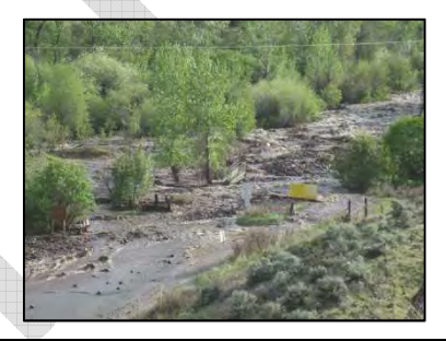
Colockum Creek Road Washout, WSU Chelan-Douglas Extension